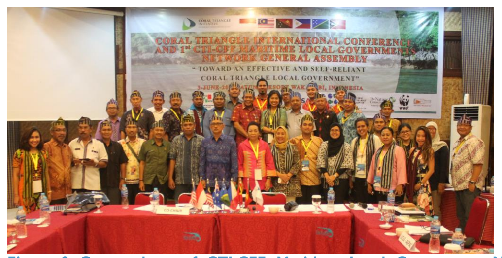
Figure 9 Group photo of CTI-CFF Maritime Local Government Network International Conference

The first Coral Triangle Initiative on Coral Reefs, Fisheries and Food Security (CTI-CFF) Local Government Network International Conference were intended as a vessel for each members to communicate, share practical experience and lesson learned in managing marine environment. It was hoped that the similar event will be conducted regularly involving more local governments participants from other CT countries. In addition, the conference was served as the opening of the first CTI-CFF Maritime LGN General Assembly.