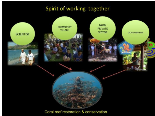
Figure 6 Stakeholder involvement in restoring coral reef habitat in Buleleng Regency

The development of Marine Protected Area (MPA) in Buleleng Regency were initiated in 2000. This effort continues until Buleleng produced Buleleng Regency's coastal zone management strategic plan (2009-2027) in 2008 in which it mentioned about the planning of MPA development. In 2011, Buleleng Regency announced the gazettement of MPA in Bululeng. There were three case study being presented which are West Buleleng MPA, East Buleleng MPA, and Central Buleleng MPA. The first two mentioned MPA involved extensive coral reef habitat restoration using biorock method, hexadome method, reef transplantation and Bioreeftek method. The lesson learnt from Buleleng is the partnership between government, scientist, community village, NGOs and Private Sector.