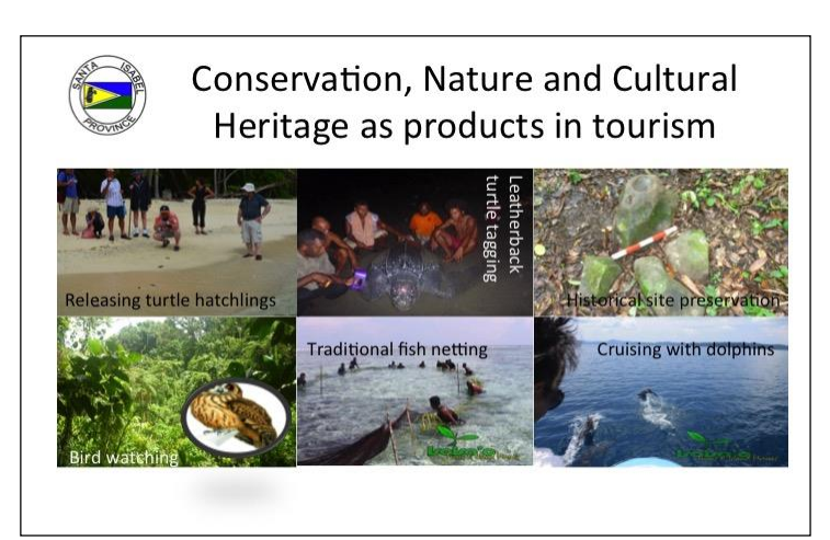
Figure 7 tourism products offered in Isabel Province, Solomon Islands

The Isabel Province Government (IPG) developed policy statement on four (4) thematic target areas, which are tourism develooment, community assistance to business, infrastructure development as driving factor to economic development and enhancing women in small economic aspiration. The tourism development in Isabel Province is based on the resource management as product to drive blue economy in tourism sector. Several activities that has been done by the provincial government were architect design, marine biodiversity survey, consultation with traditional owning groups and dialogue with National Government to secure the development funds. The Isabel Provincial Government has prioritised its community assistance grants through provincial members on helping existing businesses to expand, assisting new business operations and providing training on entrepreneurship and small business management through Business and Commerce office. The IPG prioritized the infrastructure development on building of roads connections to economic regions mainly on agriculture and agro-forestry in the province, build additional airports to improve tourism development and build Tatamba economic centre. In term of enhancing women in small economic aspirations, IPG through its community assistance program has allocated and disbursed 240,000 dolar to assist women in economic related projects.