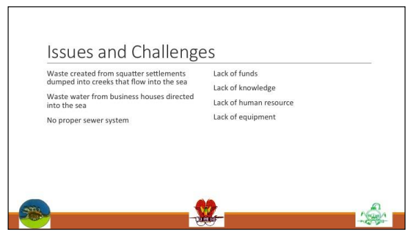
Figure 2 Issues and challenges faced by Alotau

Milne Bay is a maritime province that is made up of 4 districts in which three of the districts are made up of small islands and one on the mainland of Papua New Guinea. The capitol city of Milne Bay province is Alotau town. The town is located on the mainland of PNG where 12,000 people reside. It has 6 wards and 6 councillors. The town faces waste management issues since there are no sewer water systems. As a result, wastes from the settlement area were dumped in to the creek. In addition, the wastewater from the business house was directed in to the sea. In the end, all of the wastes were flow to the sea. The town government needed to overcome these issues. How ever, they face some challenges such as lack of funds, knowledge, equipment and human resource.